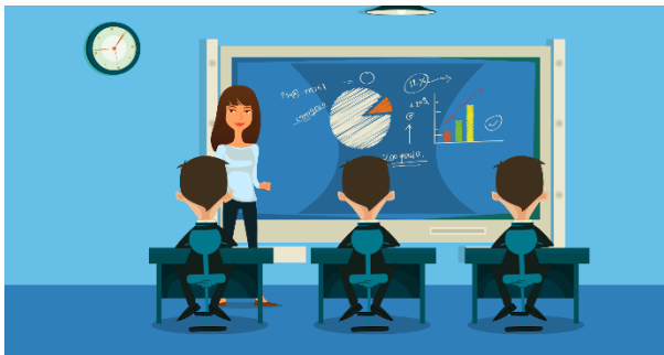
Figure 1. Traditional education in school