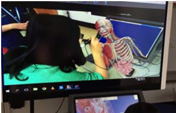
Figure 3. Medical use on VR

These two pictures are about the difference between traditional education and digital education. After listening to the teacher's explanation, you can go home and use digital materials to learn at home. The bullets can add to the impression of learning. Inspire children's upward momentum in learning.