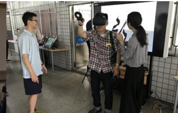
Figure 4. Actual use of VR class

Digital education, there is more virtual reality education. Not only can you use digital technology to attend classes, but you can also experience the content of the course. The virtual reality education is the most widely used in medical education. The most important thing for medicine is practical experience. The textbook is second, combined with virtual reality and learning, you can get more practical experience.