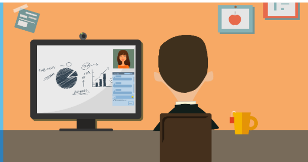
Figure 2. Virtual Reality education in house

These two pictures are about the difference between traditional education and digital education. After listening to the teacher's explanation, you can go home and use digital materials to learn at home. The bullets can add to the impression of learning. Inspire children's upward momentum in learning.